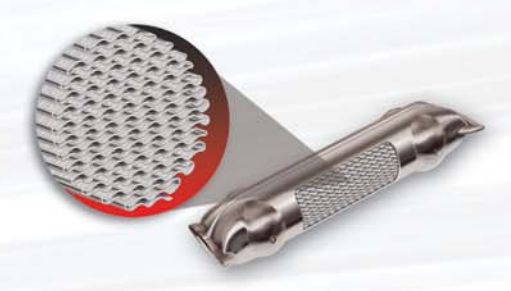
The heat exchanger features a unique corrugated stainless steel panel to help ensure reliability.